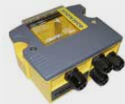
CBX100LT Connection Box