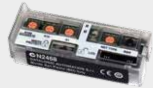
BM100 Backup Module